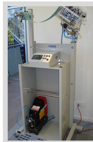
The VBrS is the Ideal partner with the VB1