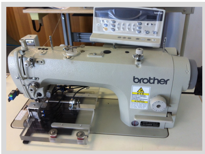
Powered with Brother Reliability